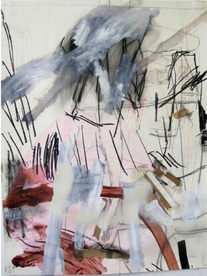
Elyss McCleary The Etched Pinks

W: http://www.elyssmcclary.blogspot.com.au/